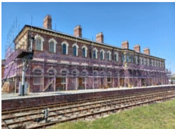
The restored Cambrian Station Building in Oswestry

Cultural and heritage assets across the county have also received a new lease on life. Several historic buildings have been restored such as Ellesmere Yard, the Cambrian Station Building (left) in Oswestry, and St Johns Church, Doddington. This work is preserving Shropshire’s rich history while creating new spaces for events and gatherings. These efforts have improved local perceptions and increased visitor numbers,